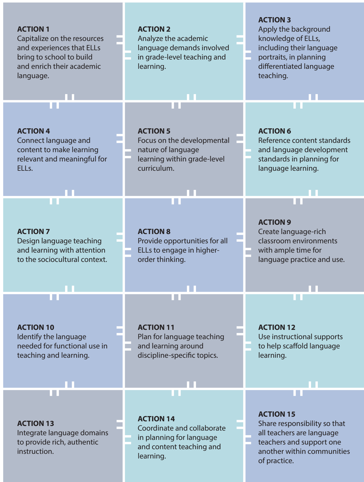
Figure E: Essential Actions for Academic Language Success